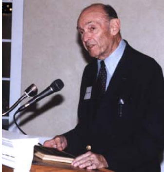
Harold Friedman Lifetime Achievement Award